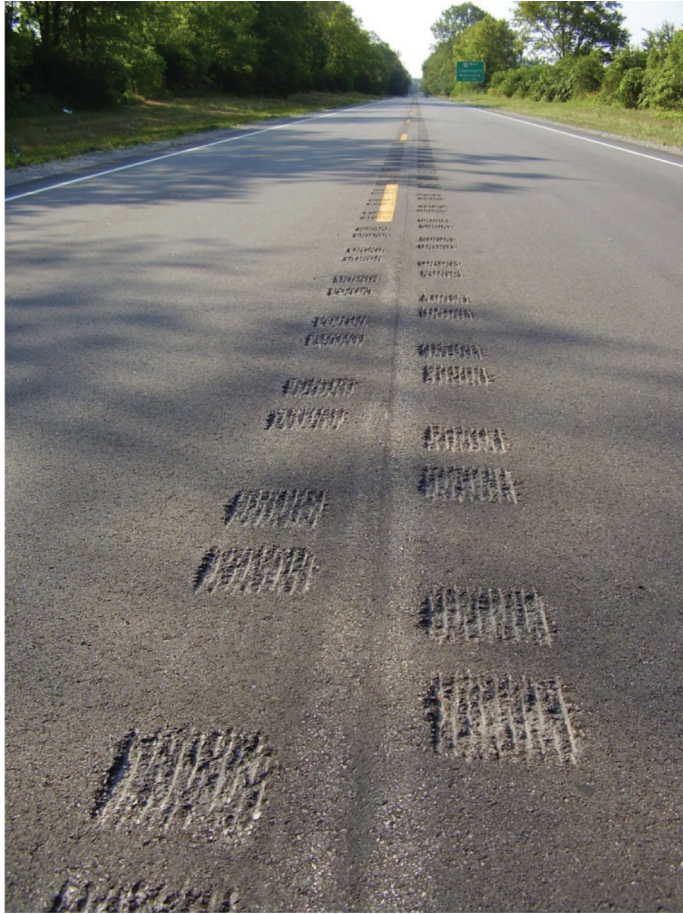
Figure B.33 View of SR35 (test section 1).