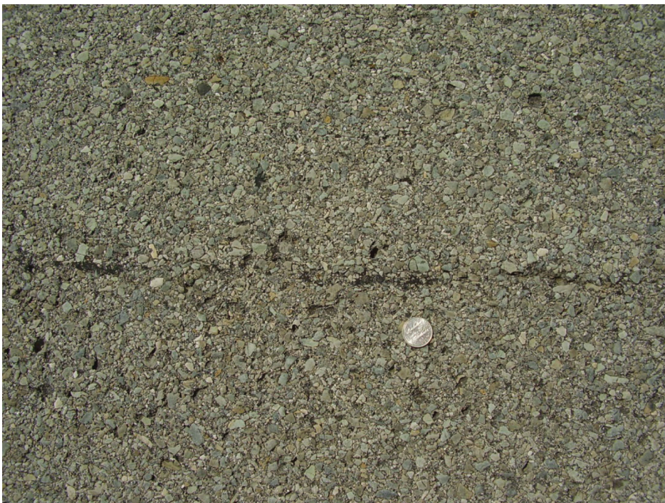
Figure B.2 Joint adhesive visible on surface, I64 westbound.