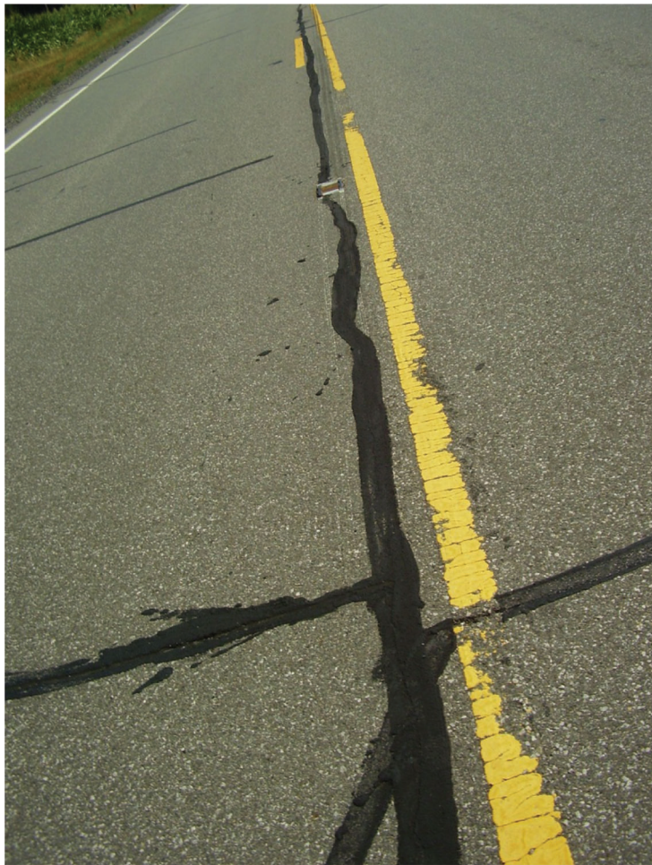
Figure B.18 General condition, test section 2 (fiber membrane).