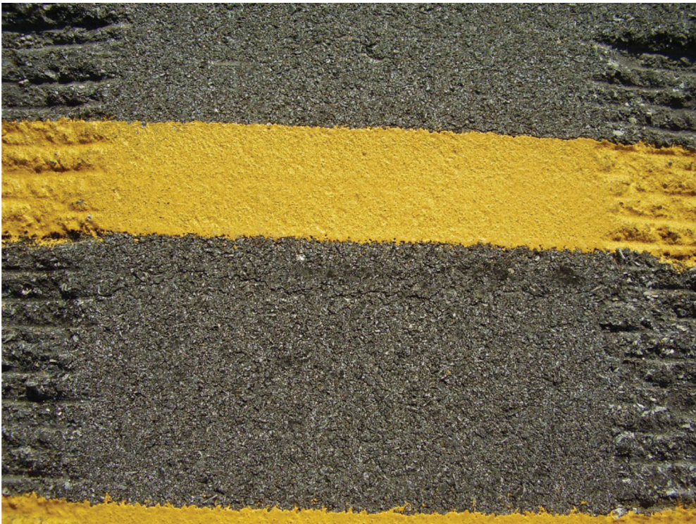
Figure B.24 Close up of SR38 showing what appears to be crack next to adhesive.