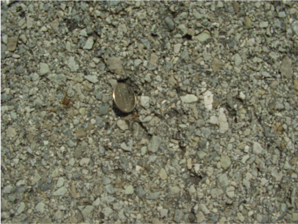
Figure B.8 One of the worst cracks observed, I64 westbound.