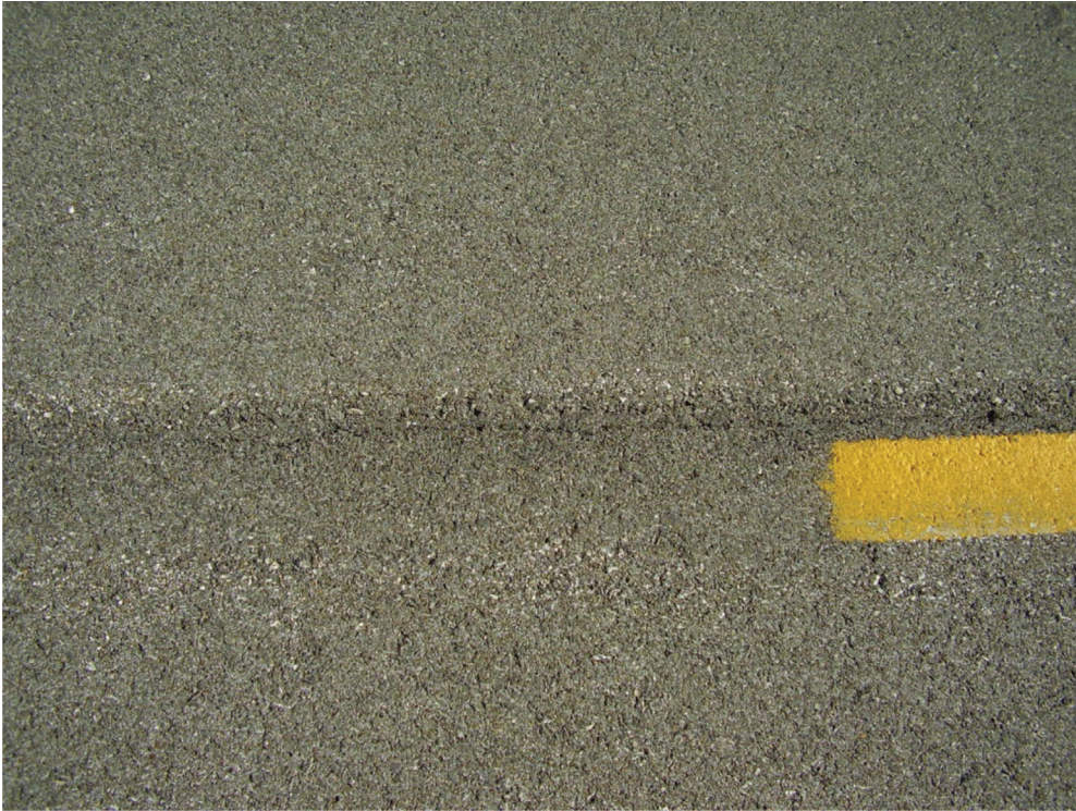
Figure B.23 Slight cracking at joint, SR38.