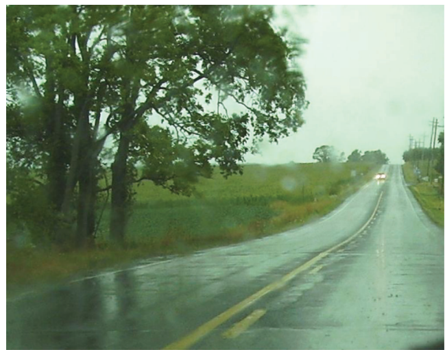
Figure 1.2 Low density material around the joint can allow for the ingress of water and air.

It is also acknowledged that the best way to prevent longitudinal joint distress is not to construct longitudinal joints in the first place (1,4). This can be accomplished by paving in echelon, which means one paver follows a few meters behind another paver, placing adjacent lanes at nearly the same time (1,4,5). In this situation, hot material is placed on both sides of the would-be joint and the material can be compacted into a virtually monolithic layer. Another option is so-called tandem paving, which also uses two pavers, but they