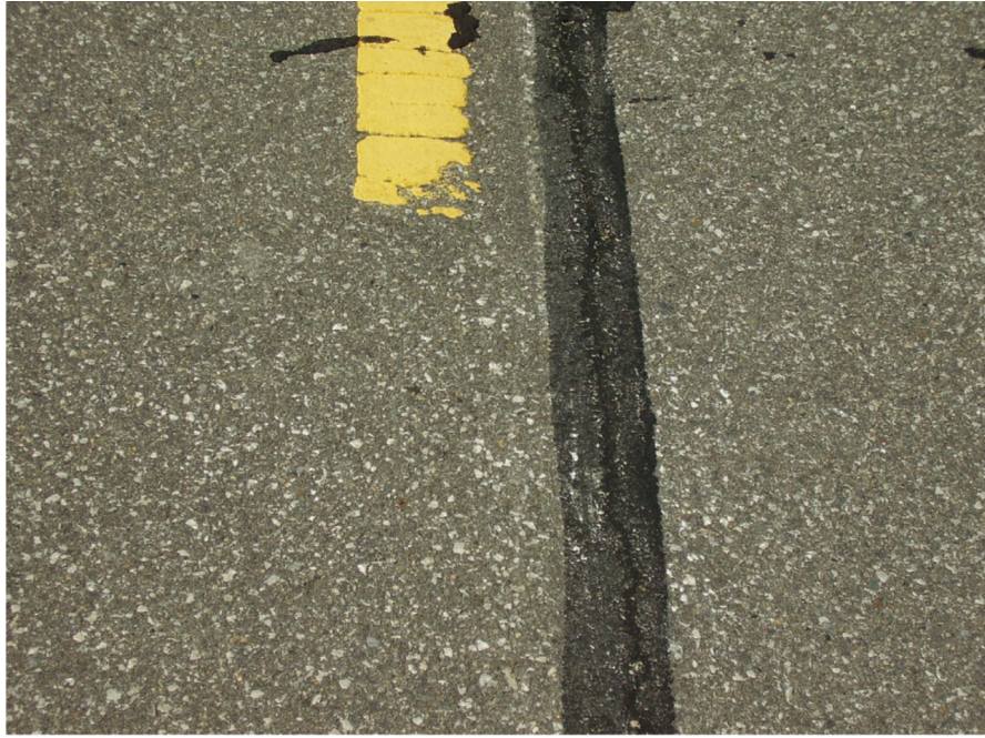
Figure B.17 SR23 joint adhesive (test section 1)—has been sealed.