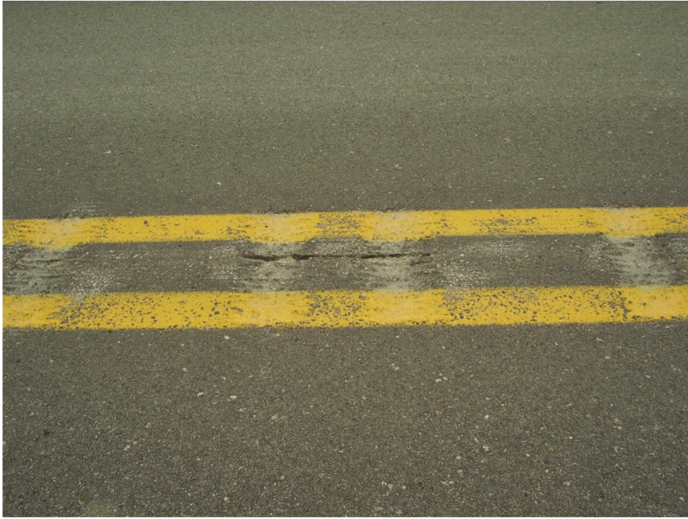
Figure B.27 Joint seal and corrugations, SR120.